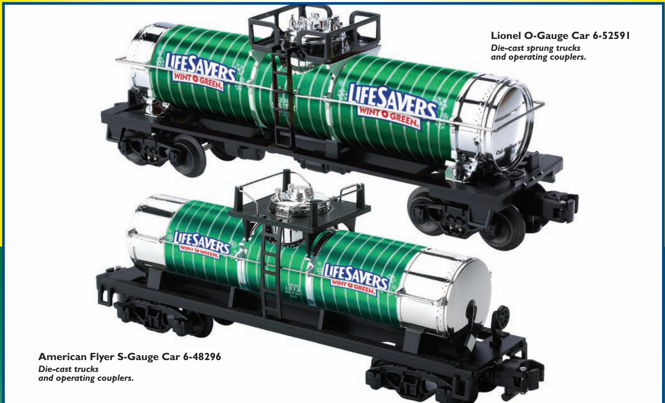
Lionel O-Gauge Car 6-52591 Die-cast sprung trucks and operating couplers.

T.T.O.S. Southwestern Division is a separately incorporated and financially independent entity and has been so since 1985. We deeply appreciate your support of the Cal-Stewart Car Program and the Cal-Stewart Meet.